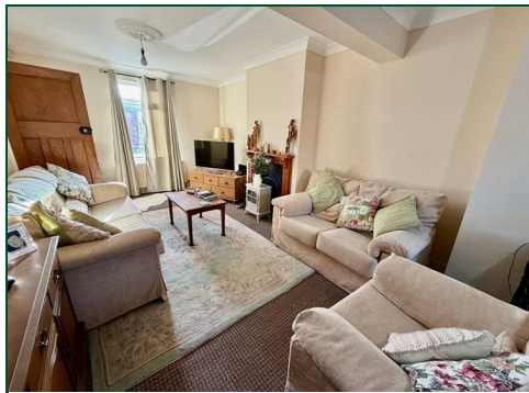
GROUND FLOOR 314 sq. ft. (29.2 sq. m.) approx.